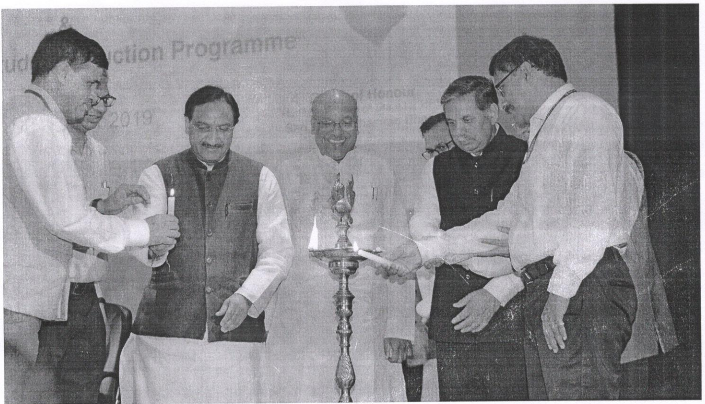
Shri Ramesh Pokriyal 'Nishank', Former Education Minister and Shri Sanjay Dhotre Former Minister of State for MoE, inaugurated IIC (2.0 version) on September 11, 2019.

MIC has envisioned encouraging creation of 'Institution's Innovation Council (IICs) across selected HEIs. A network of IICs are established to promote innovation and entrepreneurship in the Institution through multitudinous modes leading to an innovation promotion ecosystem in the campuses. MIC has established Institution's Innovation Council in more than 2200 Institutions till November 2020.